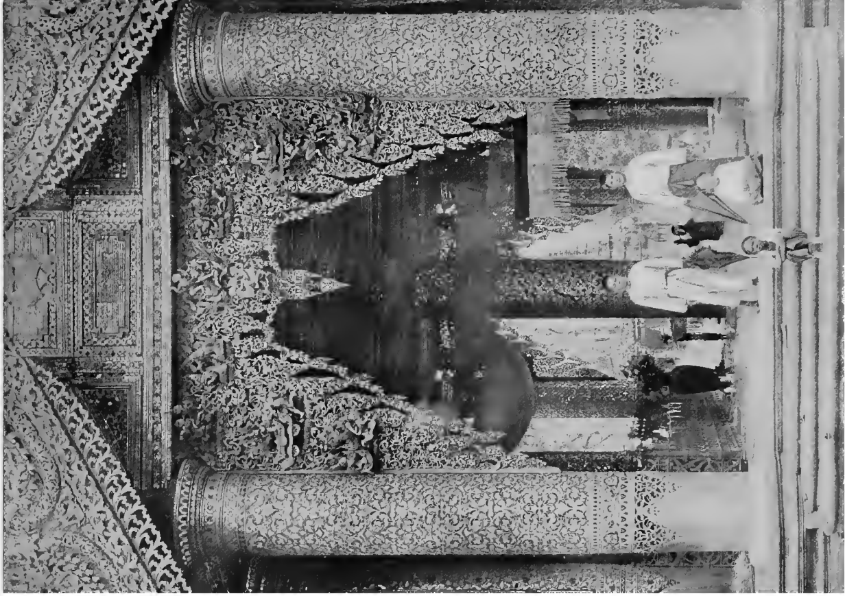
At the Entrance to the Shwe Dagon Pagoda, Rangoon